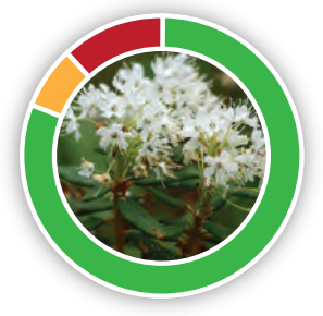
Natural Features (e.g. bog conservation areas, grass meadows)