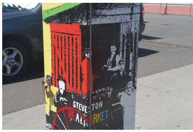
Utility Box Art Wraps, Andrew Briggs, 2015

Overlooking the south arm of the Fraser River, the picturesque four-acre site features London Farm House and a park which illustrate rural life in Richmond between 1890 and 1920. The site also includes beautiful heritage perennial flowers, a kitchen and herb garden, the restored Spraggs family barn, an outside exhibit of large, antique farm equipment, chickens, honey bees and community gardens.