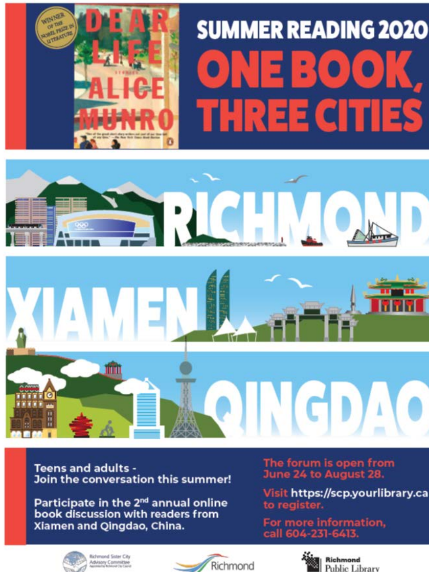
Promotional Poster for “One book, Three Cities” book club

Residents in Richmond, Xiamen and Qingdao participated in an online discussion forum from June 24 to August 22. The program was a great success and there was not only participation from the three cities but all over the world.