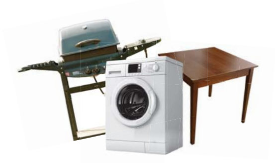
LARGE ITEM PICK UP PROGRAM

Centralized collection of household materials that cannot be recycled.