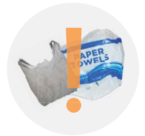
Plastic bags such as grocery bags and package overwrap.