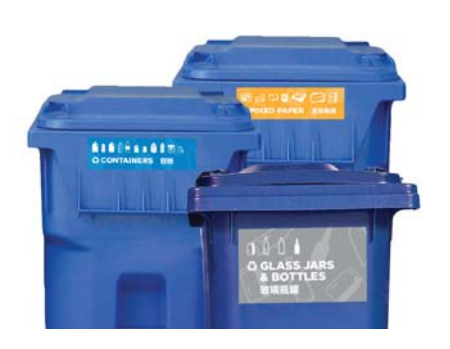
BLUE CART PROGRAM

Centralized collection of food scraps, food-soiled paper and yard trimmings.