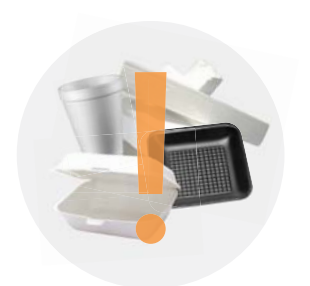
Polystyrene foam (e.g. Styrofoam) including cups, blocks and packaging.