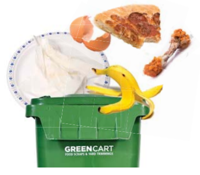
GREEN CART PROGRAM

Scheduled pick up of six household items per year. Call 604-270-4722 to arrange pick up.