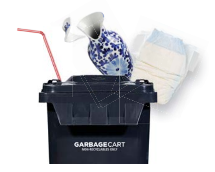
GARBAGE CART PROGRAM

Richmond offers a wide range of programs and services to make it easy and convenient for residents to recycle. For multi-family complexes, programs range from recycling carts in central collection areas to Richmond Recycling Depot drop-off services. This guide highlights each program and provides tips on how to recycle and reduce waste.