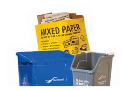
BLUE BOX PROGRAM

Weekly collection of food scraps, food-soiled paper and yard trimmings.