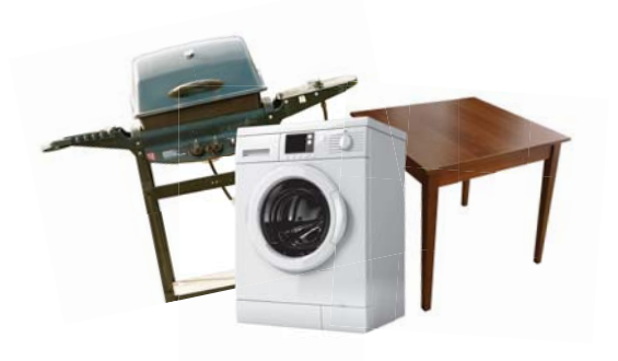
LARGE ITEM PICK UP PROGRAM

Biweekly curbside collection of household materials that cannot be recycled.