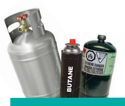
DID YOU KNOW?

Propane tanks and butane cylinders are hazardous and need special handling. Please take these items to the Richmond Recycling Depot.