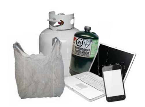
RICHMOND RECYCLING DEPOT

Weekly collection of mixed packaging containers, mixed paper and glass bottles/jars.