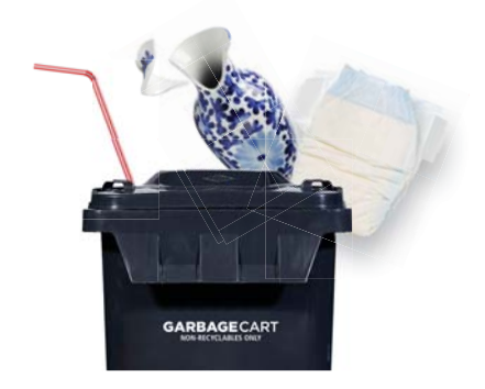
GARBAGE CART PROGRAM

Richmond offers a variety of programs and services to make it easy and convenient to recycle. This guide highlights each program and provides tips on how to recycle and reduce waste.