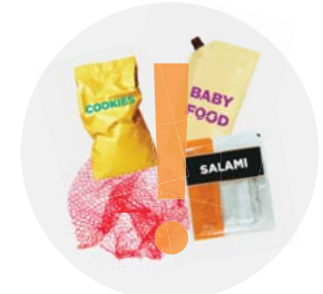
Flexible plastic packaging such as ziplock bags, crinkly wrappers, woven and net plastic bags, etc.

Propane tanks and butane cylinders are hazardous and need special handling. Please take these items to the Richmond Recycling Depot.