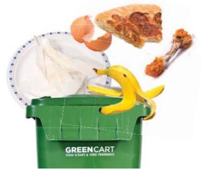
GREEN CART PROGRAM

Scheduled curbside pick up of six household items per year. Call 604-270-4722 to arrange pick up.