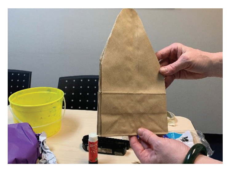
Step 3: Cut the petal shape for your flower.