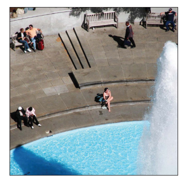
Neighbourhood attractions - water features.