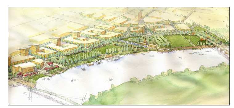
Bird's eye perspective sketch.