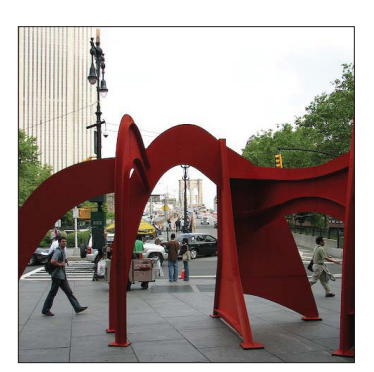
Neighbourhood attractions - public.