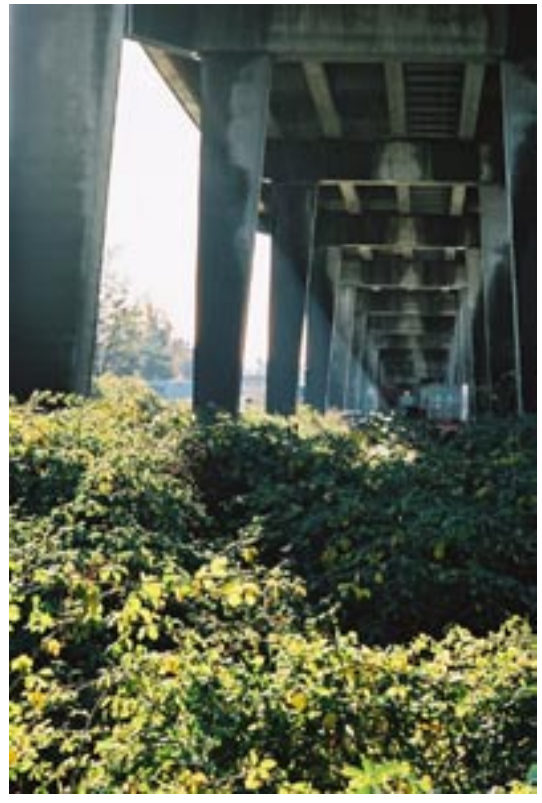
Knight Street bridge