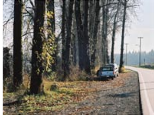
No. 9 Road Fishing Bar