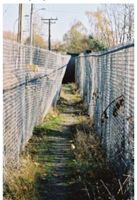
Public access through Richmond Plywood