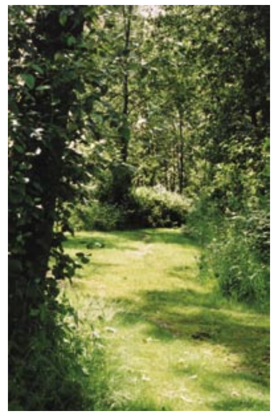
No. 7 Road Pier / Park