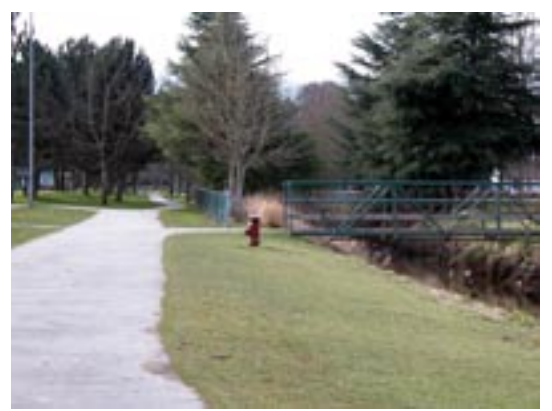
South Arm Park