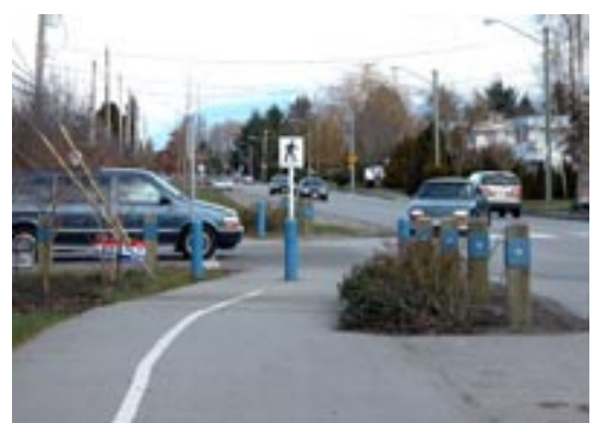
Cycling path on Garden City (south of Francis Road)