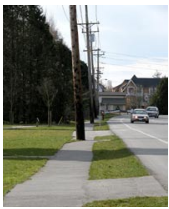
Garden City at Cook Road (looking south)

The Kit of Parts, established through the Beautification Strategic Team, has identified different greenway links and associated design criteria for Garden City Road. A number of large residential redevelopments are occurring along Garden City Road in the McLennan areas that will be responsible for constructing sections of this greenway as per the McLennan North Sub-area Plan and Kit of Parts. The potential ownership and land use designation of the DFO lands (also referred to as MoT lands) is under review. Alderbridge Way is a proposed cycling route and greenways that will connect to the Shell Road Greenway and the Nature Park. Garden City Road is presently being constructed north of Sea Island Way with the intention of extending it to River Road. Public art at the intersection of Garden City Road and Sea Island Way will reinforce this area as a 'gateway' into Richmond. Pedestrian and cycling links to Oak Street Bridge are being considered for the north side of Sea Island Way. The former Bridgeport Market site is being redeveloped with public waterfront access along the North Arm of the Fraser River.