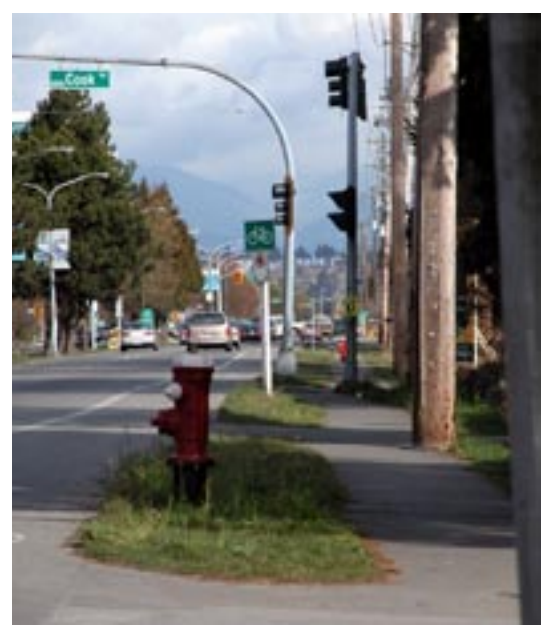
Garden City at Cook Road (looking north)