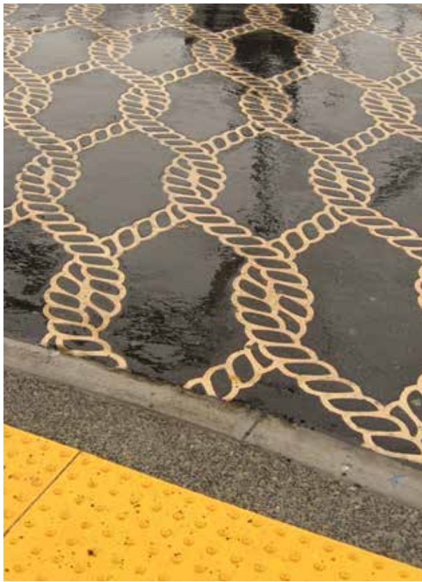
Crossover , Carlyn Yandle, 2011 Steveston