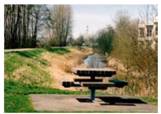
Pocket Park Fraserwood Industrial Park