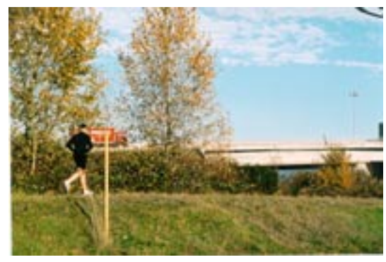
Dyke Trail to Boundary Road