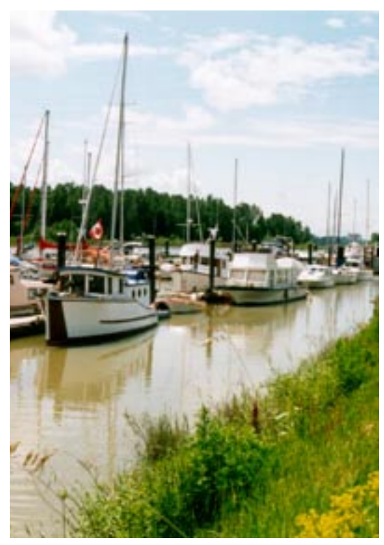
Shelter Island marina