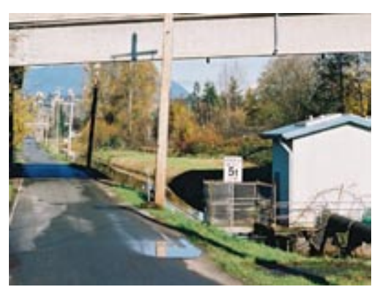
Boundary Road / New Westminster