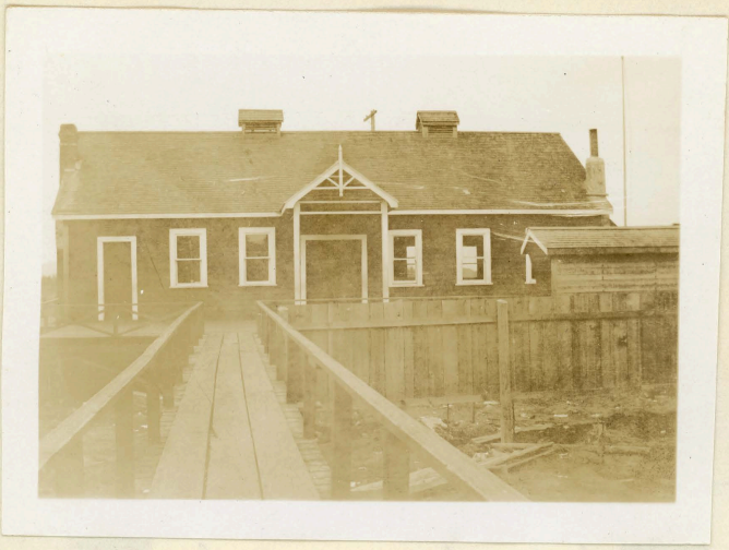
Japanese school on Sea Island.