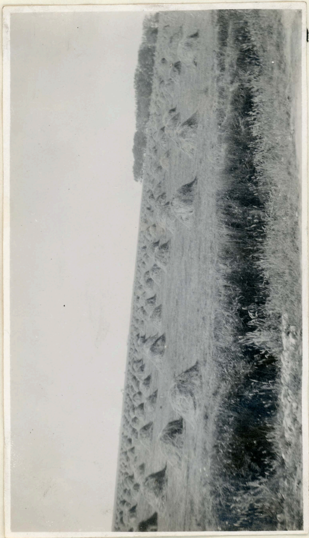
A Good Crop Lulu Island.