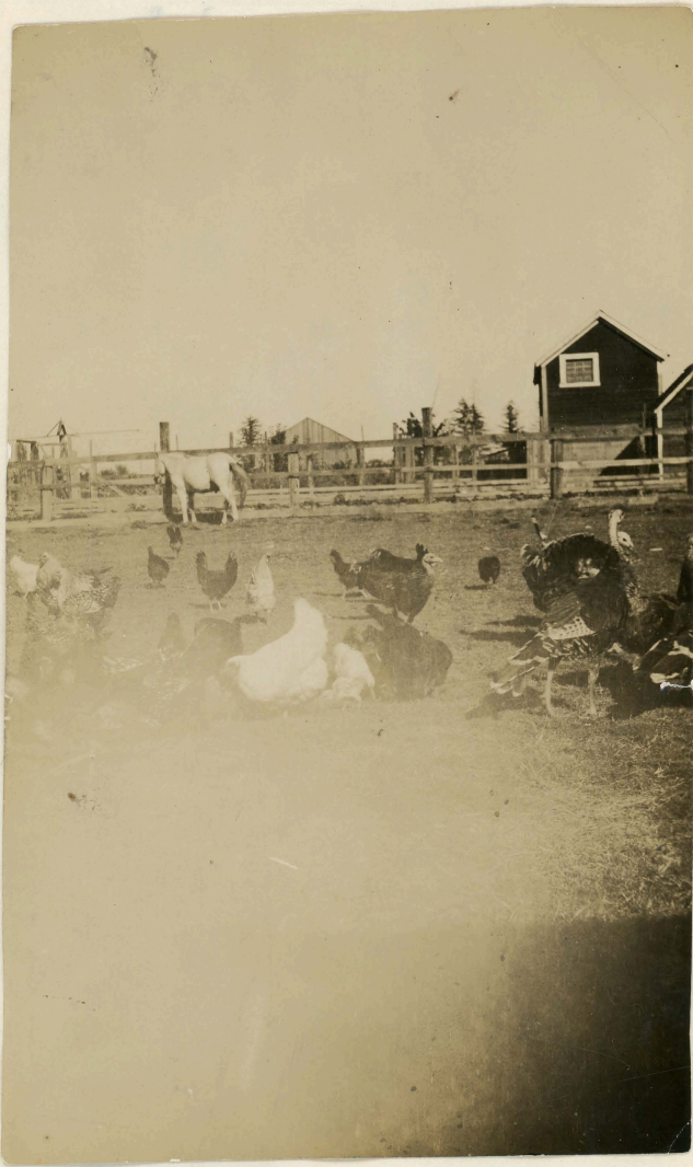
A Real Farm yard.

Faint vertical text on the left side of the page, possibly a name or date, which is mostly illegible due to fading.