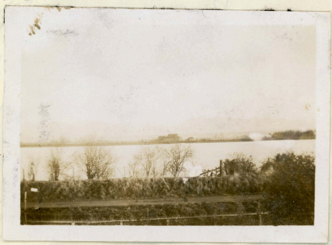
A view from my home. Across the river is Sea Island. In the background are mountains which can be seen in every direction.