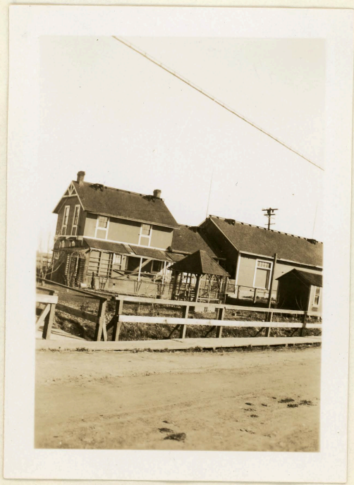
B.C. Electric Station Steveston