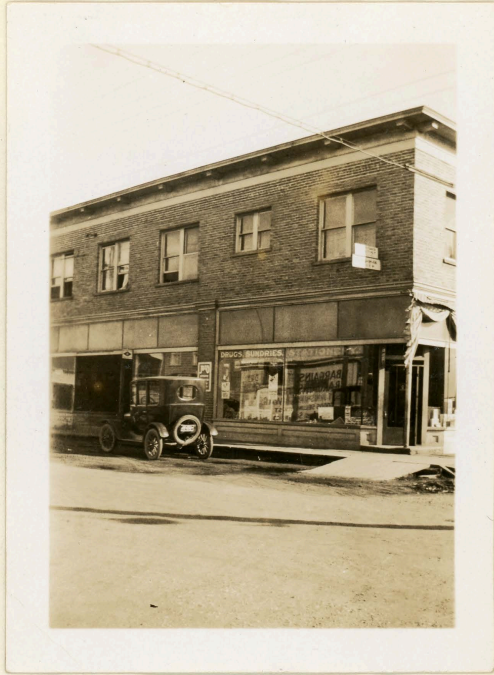
Principal Block in Steveston showing corner Drug Store.