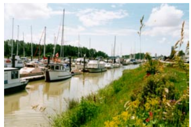
Responding to different uses along the waterfront