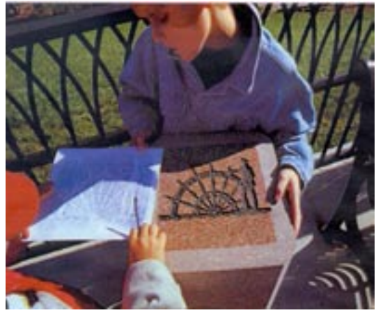
Outdoor classrooms - rubbings from concrete tile