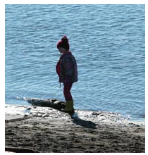
Water safety programs