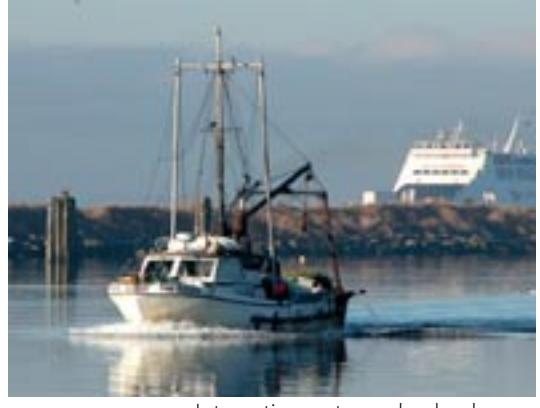
Integrating water and upland uses