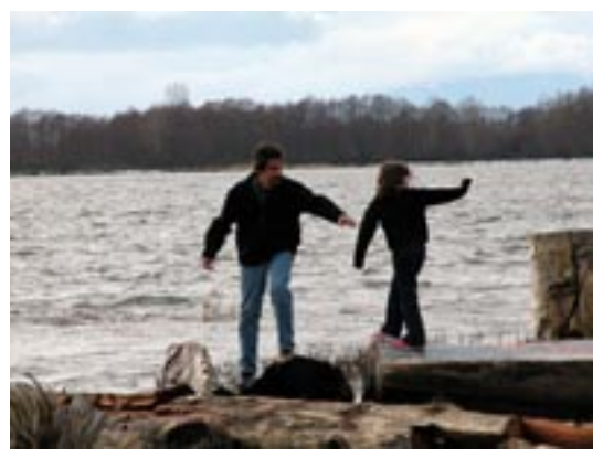
Access to the water