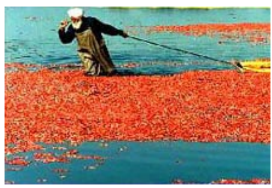
Ensuring the viability of agriculture