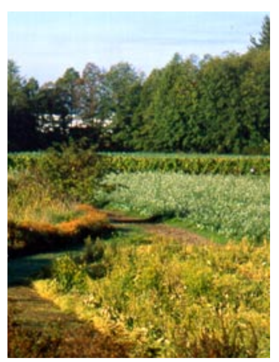
The rural landscape experience