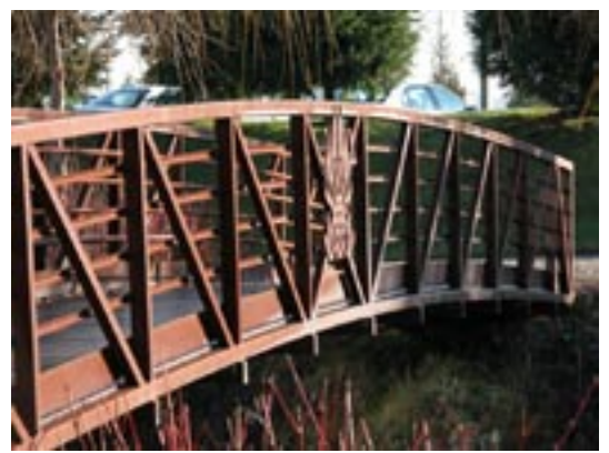
"Island of Bridges" concept