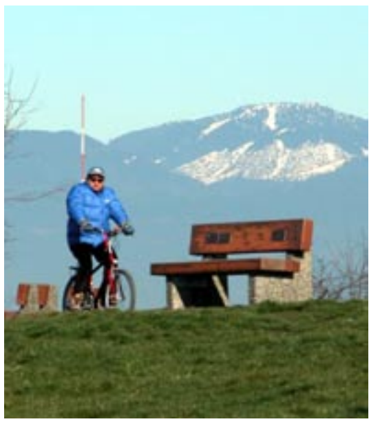
Promoting ease of access on Richmond's flat terrain