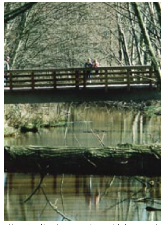
Horseshoe Slough - eco-corridor and drainage canal