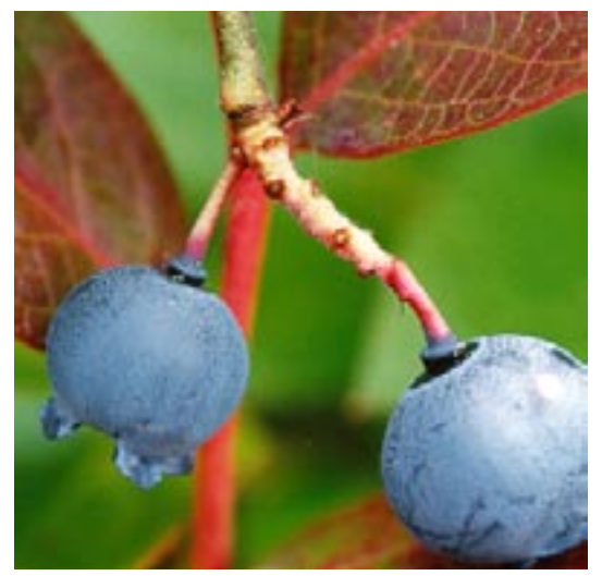
Connecting to the Nature Park