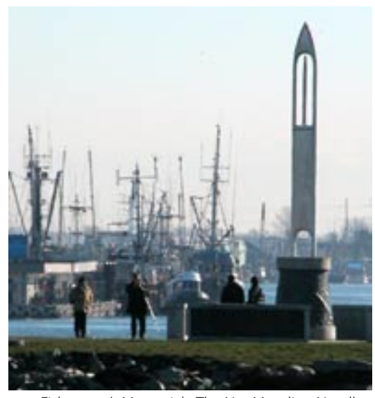
Fishermen's Memorial - The Net Mending Needle