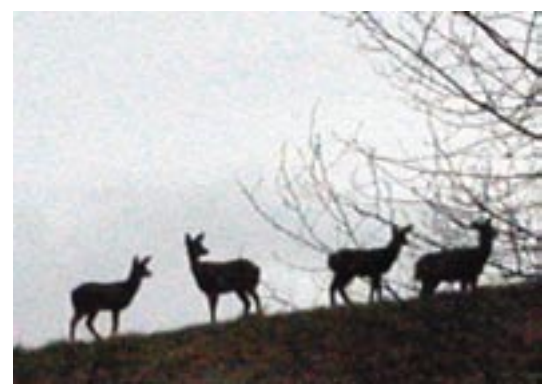
Deer in East Richmond

Recognizing fully that the efficient movement of water and the prevention of flooding is a priority for the safety of the island and residents, there may still be opportunities for creative solutions that allow for maintaining an open canal while ensuring safe storm water management and maintenance. One potential corridor for this treatment may be the proposed Shell Road Greenway, a major north-south connector that connects many environmental areas and has an existing open canal.