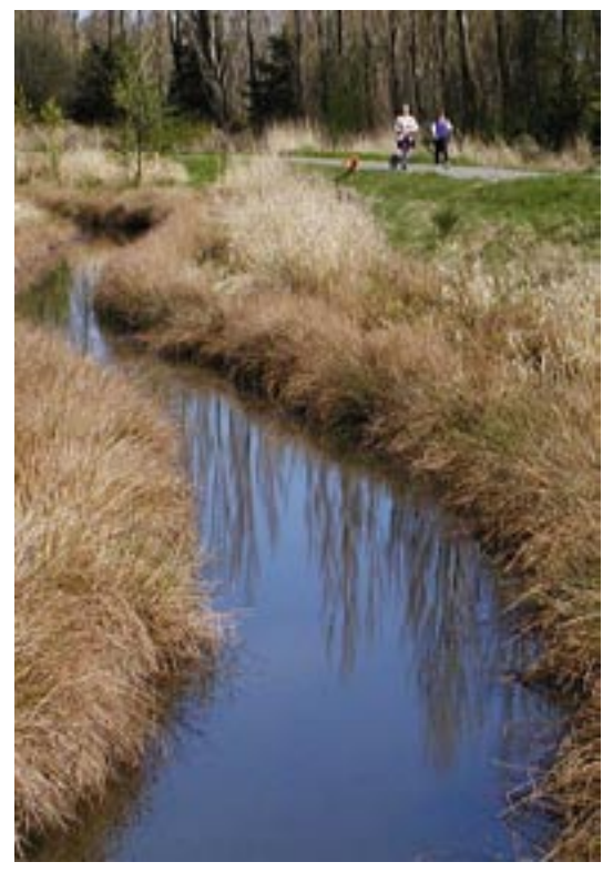
Waterways and recreational corridors

The recent attention from the Department of Fisheries and Oceans on the open ditches and canals in Richmond can also be viewed as an opportunity to re-evaluate the value of keeping open waterways. Not only are these water ways part of the Island's vernacular landscape, they provide an important source of irrigation water for agriculture, environmental benefits, are visually interesting and have the potential to add to the recreational experience.