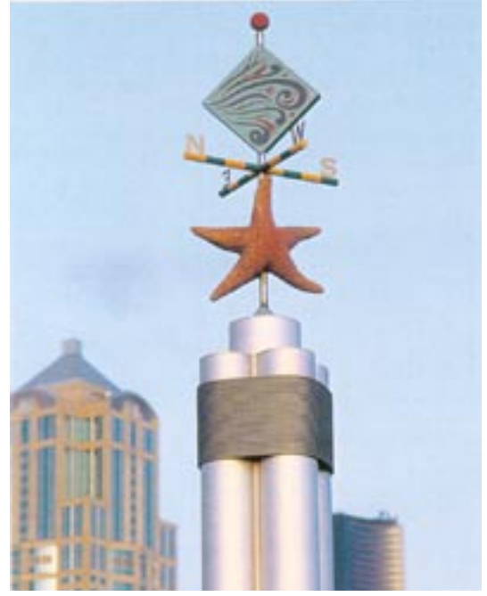
Maritime theme signage posts are functional and playful