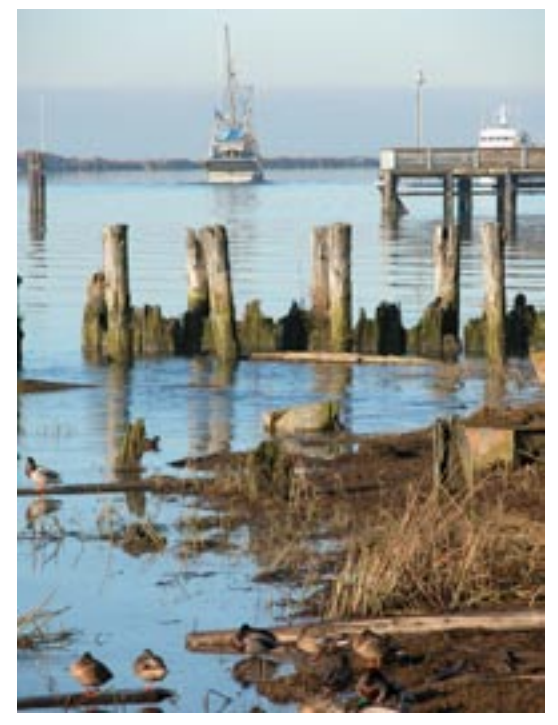
It's all here: heritage, the working river, and nature