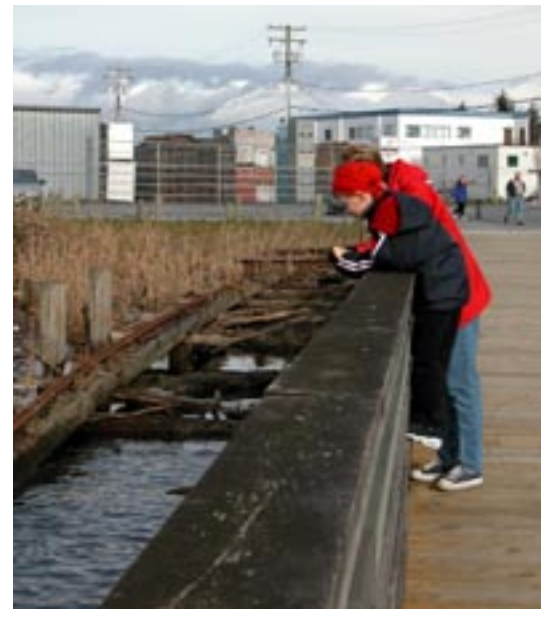
Getting people out and over the water

Opportunities abound and it is recognized that the trail system will need to be flexible and able to respond to these opportunities as they arise.