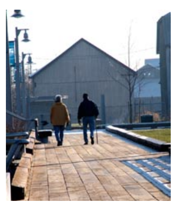
Trails linking historic sites