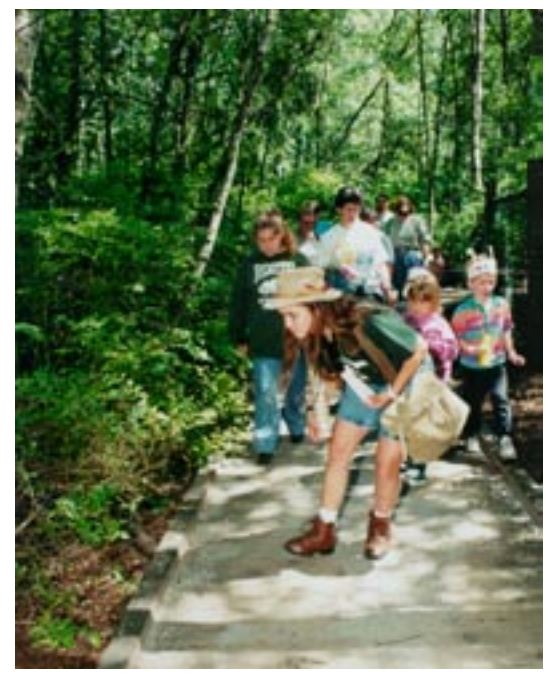
Nature Park group interpretation

Another outcome is the drafting of a Walkable Richmond Accord between the City of Richmond, The Richmond School District and the The Richmond Health Services. The purpose is to ensure a coordinated effort between these parties to create a better and safer walking environment in Richmond.