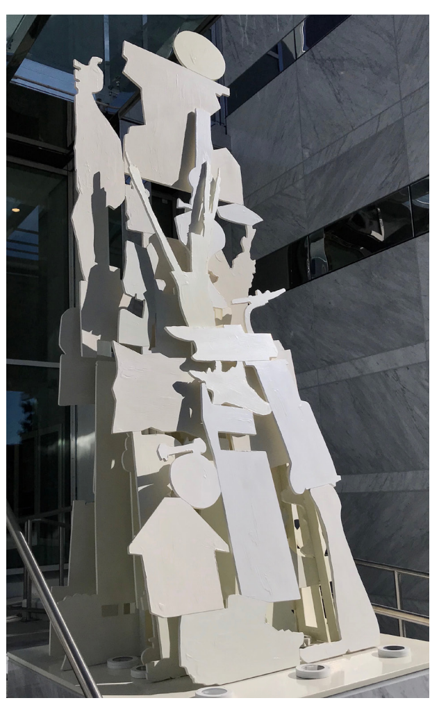
The Shape of Things, Kelly Lycan, 2018

Public Art in Richmond has truly blossomed since the founding of the Program by City Council in 1997. We are proud to be home to a wealth of signature artworks identifying Richmond's dedication to creating a vibrant city in which to live and visit. Use this brochure as a guide to visit some of our public art works in Lansdowne Village. Throughout the city, you will discover public art integrated into parks, architectural facades, on the grounds of civic buildings and along the Canada Line skytrain stations.