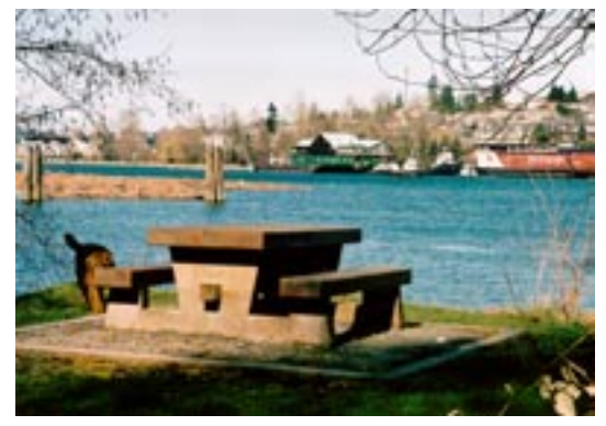
North Arm of Fraser River

The Fraser River Port Authority is presently working with the City on the servicing agreements to allow for development of 600 acres of Federal lands into an industrial park. This will provide a significant link in the trails system that is presently missing. Ecowaste Industries has expressed different ideas over the years for the future use of their lands. To date nothing definitive has been decided. There are great opportunities to develop the waterfront at the south end of the No.7 Road canal into a park and link this to the Legacy Lands and Riverport area.