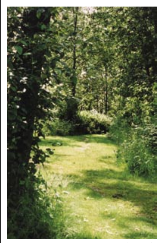
No. 7 Road Pier/Park