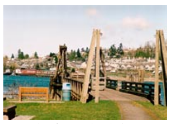
No. 7 Road Pier (former CNR barge loading pier)