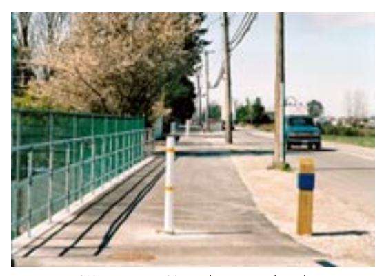
Westminster Hwy. designated cycling route