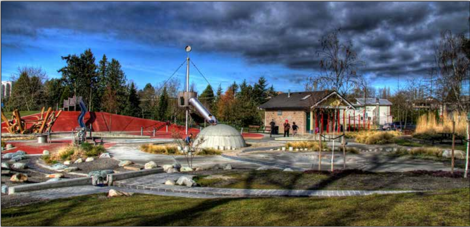
Garden City Community Park at the Play Environment

Given the changes in the community and the consequent changes to the parks and open space system, the services provided by the Parks Division are expanding. In the last decade the new parks that have been built offer greater diversity in programming opportunities and landscape types. The size and number of private development projects that include significant parks and open space has increased dramatically in the last 5 years requiring a new level of service. Over the next decade new activities and new programs will be introduced to engage the city's diverse population and will provide more opportunities for active living and connection to Richmond's unique environment. In addition, in order to address the increasing complexity of the system, new strategies for sustaining high-quality operations and resource management are being adopted.