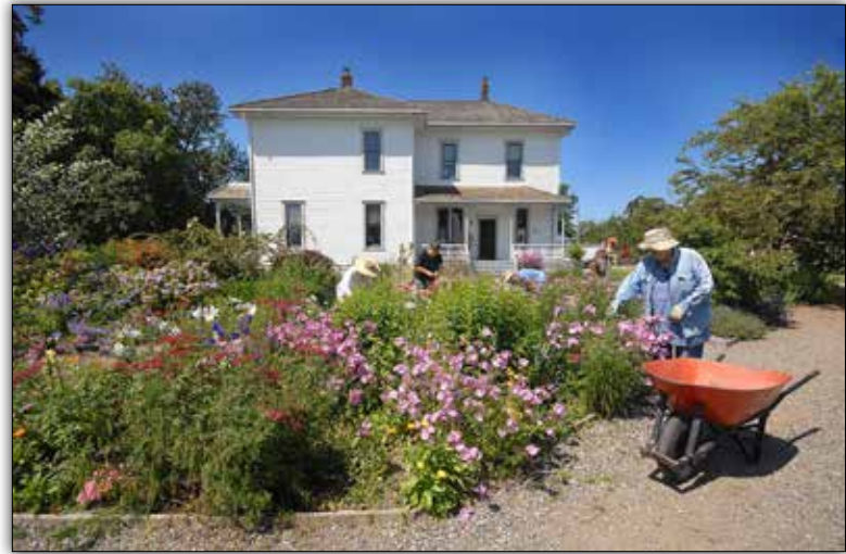
London Heritage Farm and community garden

In addition, the City's long-standing relationship with the Richmond School District has resulted in a high degree of cooperation in co-locating schools and parks and in shared use of facilities. School District sites comprise 22% of the total parkland in Richmond and are a critical part of the network of neighbourhood parks. The School District is one of the key stakeholders considered in the Strategy.