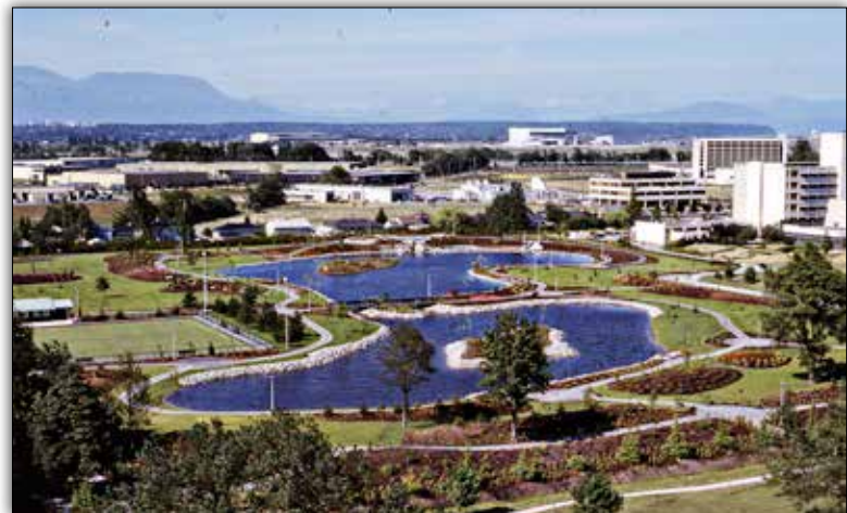
Minoru Lakes c. 1984

The evolution of the system, from the opening of the first school park at Mitchell School in 1908 to the first park bylaw in 1957 and the rapid growth of the system since, provides a fascinating perspective on the evolution of Richmond. Through the period of suburban expansion from the 1960's through the 1990's, the majority of the network of neighbourhood and community parks was established. Meanwhile, important landmarks like Minoru Park, the Richmond Nature Park, Garry Point Park, Terra Nova Rural Park and the Richmond Olympic Oval were secured and developed, showcasing Richmond's unique places and spaces. In