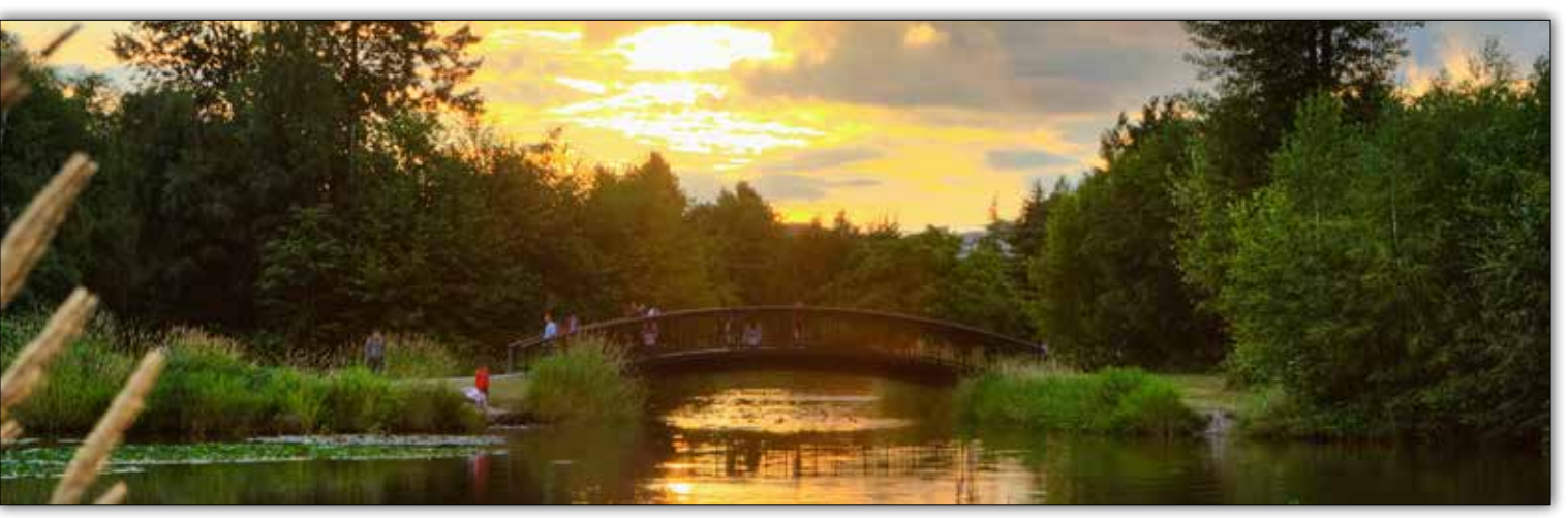
Garden City Community Park: The bridge over the stormwater detention pond

Volunteers assist the City in delivering programs and special events. While volunteers are an invaluable resource, expanding the capacity of the City and other organizations to deliver programs and events, the benefits of social interaction and engagement are an important part of community building.