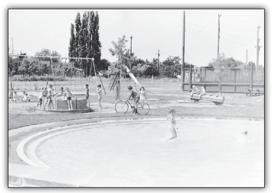
Steveston Park Playground c. 1970

The legacy of over 100 years of concerted effort by the community, the support of successive City Councils, and strategic planning and land acquisition has resulted in a system of parks, trails, and public open spaces that adds immeasurably to the quality of life enjoyed in Richmond.