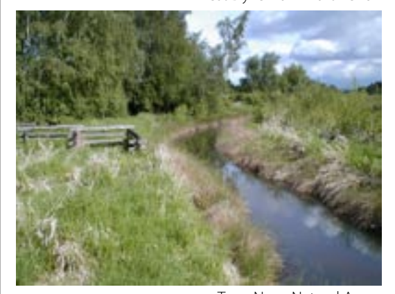
Terra Nova Natural Area