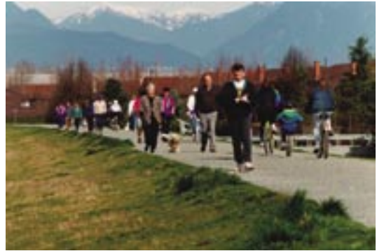
West Dyke Trail - near Garry Point Park