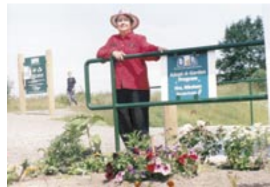
Adopt-a-Garden on West Dyke Trail