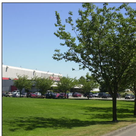
Screening Land Uses along the Highway