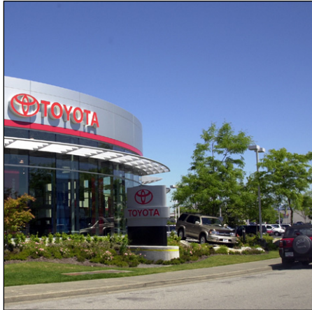
Richmond Auto Mall