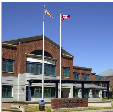
Cambie Community Centre and School