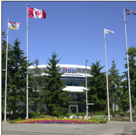
High Tech Industry