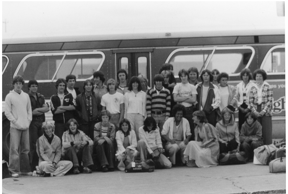
Accession 2020 9 – Kajaks team traveling by bus, date and event unidentified.