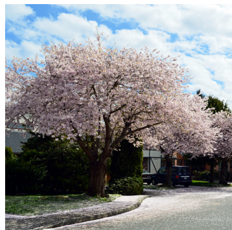
Accession 2020 26, Blossoms Falling, 2014