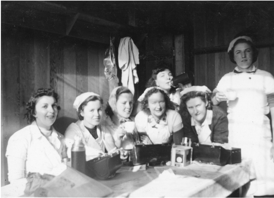
Accession 2020 8 – Steveston cannery workers, ca. 1937.

Other accessions included photographs of everyday working life at a Steveston Cannery, and the not so typical life of an Olympic athlete: