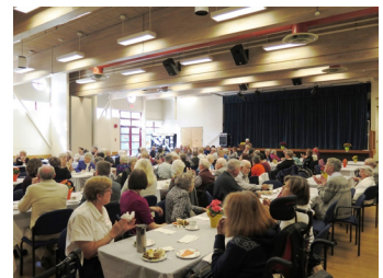
Friends of the Richmond Archives Tea, 2015.