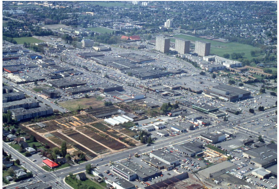
Aerial—[Looking South West, Westminster Highway and No. 3 Road, Park Towers and Minoru Park].