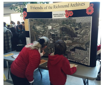
Friends of the Richmond Archives Remembrance Day exhibit at City Hall reception, 2015.

This display was a great success, with visitors remarking how interesting it was to learn of the City of Richmond’s street naming policy and the history behind these street names.