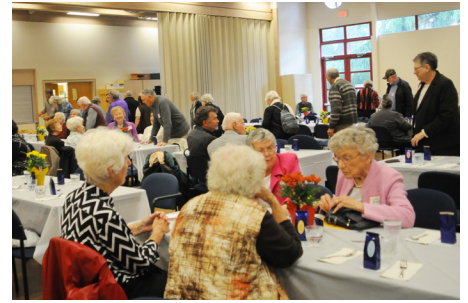
Friends of the Richmond Archives Tea, 2016.

Once again the Friends would like to thank the Board of the Minoru Seniors Society and the staff at the Minoru Place Activity Centre for their support and assistance.