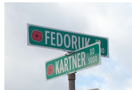
Intersection of Fedoruk Road and Kartner Road, showing newly installed poppy signs. Photo by John Campbell, November 2016.