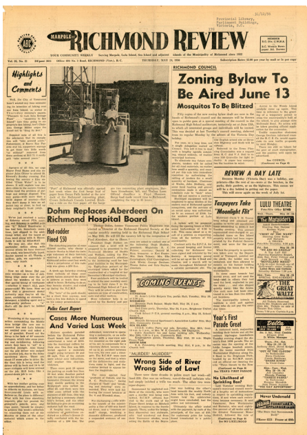
Page 1 of the Marpole-Richmond Review , May 24, 1956.