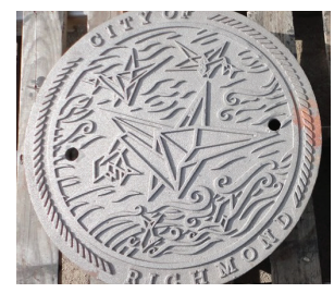
Cover Stories II Caroline Dyck, Various Locations