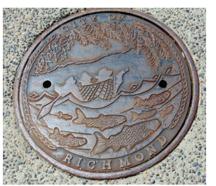
Cover Stories III Susan Pearson, Various Locations